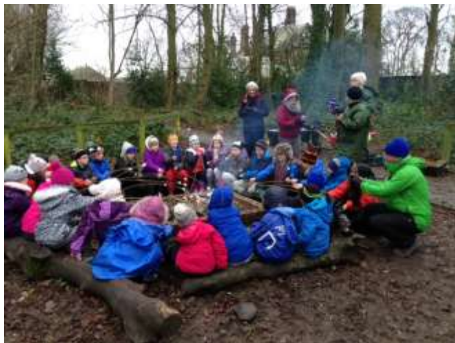
Toasting marsh melloes at Cliffe House Shepley Kirklees