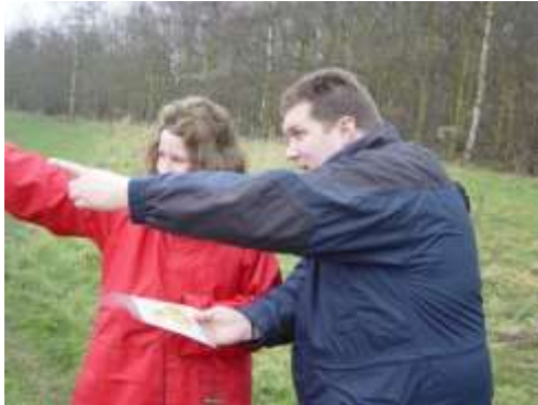
Orienteering at Oakwell Hall

Visit Leader training is available throughout the year and it is recommended that all visit leaders attend the training at least once.