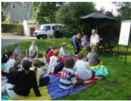
Outside Ingleton Youth Hostel

ALL THE ABOVE CAN ADDITIONALLY BE RECORDED ON EVOLVE IN A 'NOTE'.