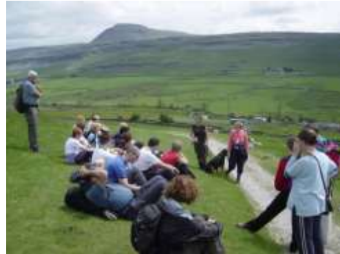
Field studies, Ingleborough