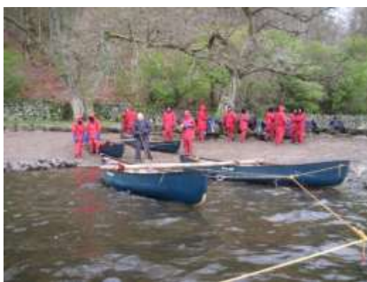
The shore of Ullswater out from Howtown, OBMS

You can add more than one provider in case you are using multiple providers in one day and you can also add accommodation separately from a provider.