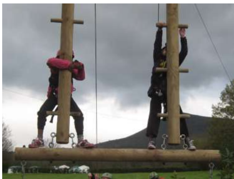
Acorn Adventure Brecon Beacons

Qualifications should be recorded in the Awards section of staff profiles on EVOLVE along with any statements of competence from technical experts.